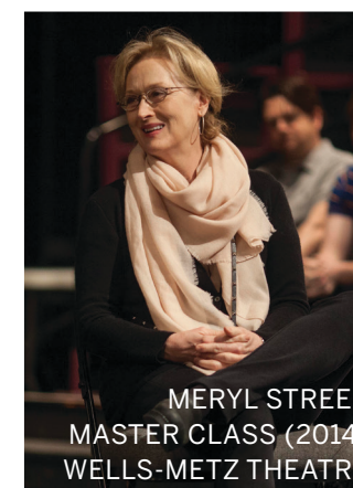
MERYL STREEP MASTER CLASS (2014) WELLS-METZ THEATRE