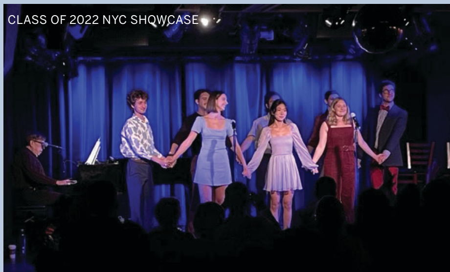
CLASS OF 2022 NYC SHOWCASE

A typical showcase week includes performing at Joe's Pub, The Laurie Beechman Theatre (or a similar venue) sponsored by the IU Alumni Association, meeting supporters at a reception expressly for the showcase participants, attending open call auditions, seeing Broadway and off-Broadway productions, and, of course, performing the showcase for industry professionals.