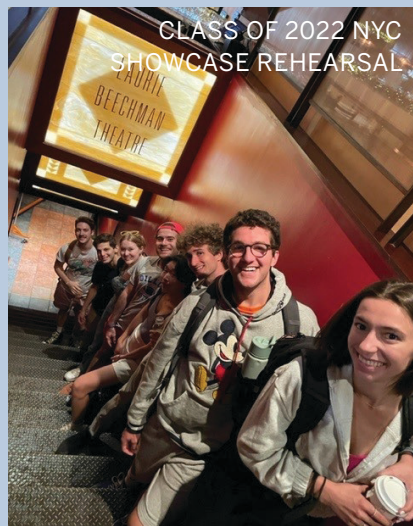
CLASS OF 2022 NYC SHOWCASE REHEARSAL