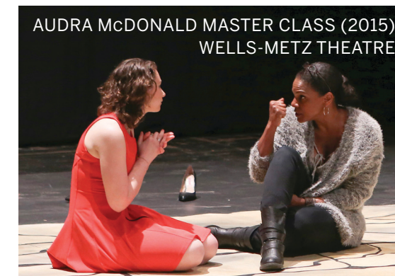
AUDRA McDONALD MASTER CLASS (2015) WELLS-METZ THEATRE