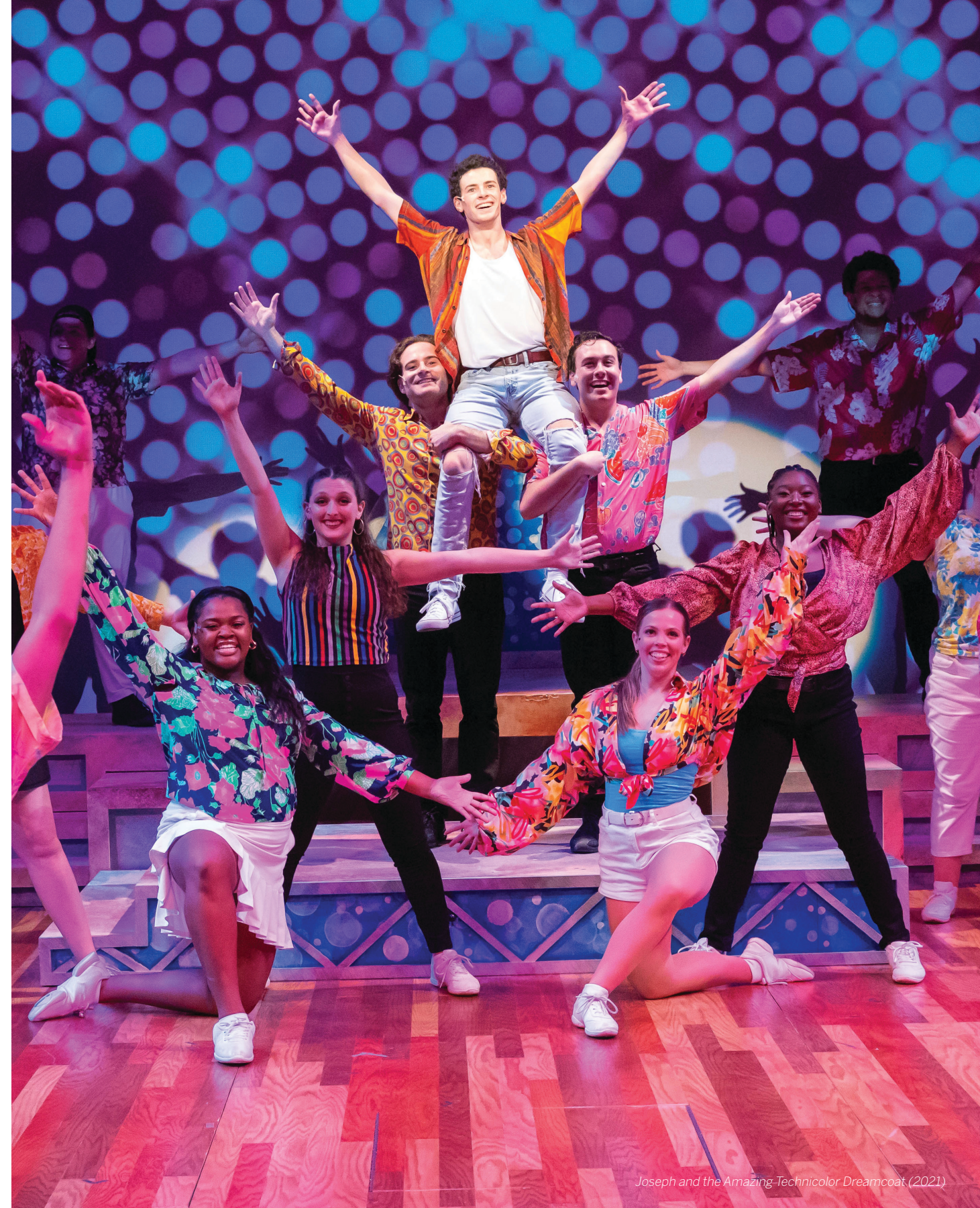
Joseph and the Amazing Technicolor Dreamcoat (2021)

Each B.F.A. Musical Theatre student is required to complete a Capstone Project before graduating. This is an independent project which the student will propose and execute with the guidance of a faculty advisor. The topic is completely at the discretion of the student, but the idea is that it should be a challenging and meaningful yet fun and rewarding project with realistic goals and expectations. Past projects have included self-produced one-person shows, self-produced large-cast shows, directing, choreographing, writing a musical, producing a holiday CD featuring the MT graduating class, and conceiving and writing short shows for children's hospitals, to name a few. Students have also taught master classes in acrobatics, stage combat, tap dancing, opera and MT singing, MT history, etc. The possibilities are endless, as long as there is some connection to the theatre with the project. Ideally, the Capstone Project is proposed sometime between the second and third years, and executed/presented within the third and fourth years.