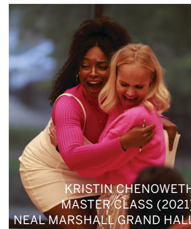
KRISTIN CHENOWETH MASTER CLASS (2021) NEAL MARSHALL GRAND HALL