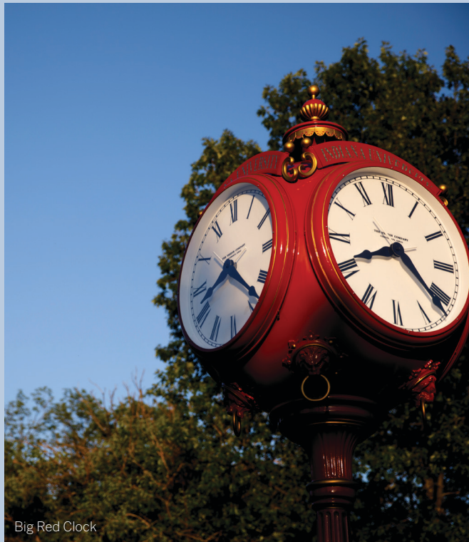
Big Red Clock

IU blends a vibrant university community with a small-town atmosphere to give you a quality of life that's hard to match. You'll quickly become part of the spirit and tradition of IU, an experience two centuries in the making. IU Bloomington attracts students from around the globe who want a classic college experience: great traditions, a gorgeous campus, international culture, Big Ten sports, and a progressive academic climate.