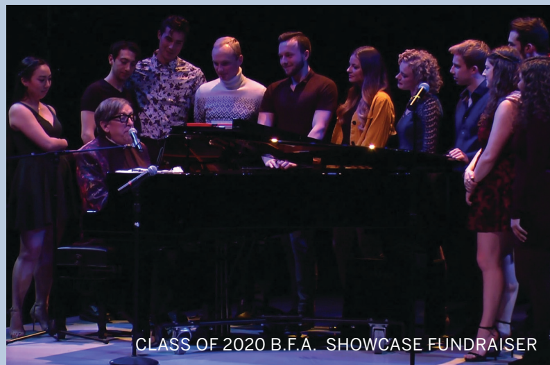
CLASS OF 2020 B.F.A. SHOWCASE FUNDRAISER