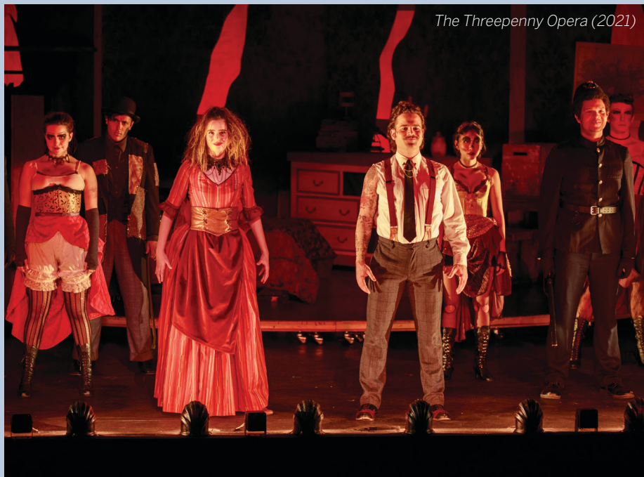
The Threepenny Opera (2021)

Performance opportunities are abundant. Led by a professional faculty recognized on Broadway, national tours, regional theatres, and internationally, the Department's main stage season of theatrical productions and dance concerts includes two musicals, one in the fall and one in the spring. The Department's professional Summer Theatre season includes musicals as well. Students have ample opportunity to produce, direct and act with University Players, a student run performing organization, as well as independent projects performed in our Studio Theatre. In addition, Bloomington boasts Constellation Stage and Screen, a professional community theatre which regularly employ our students.